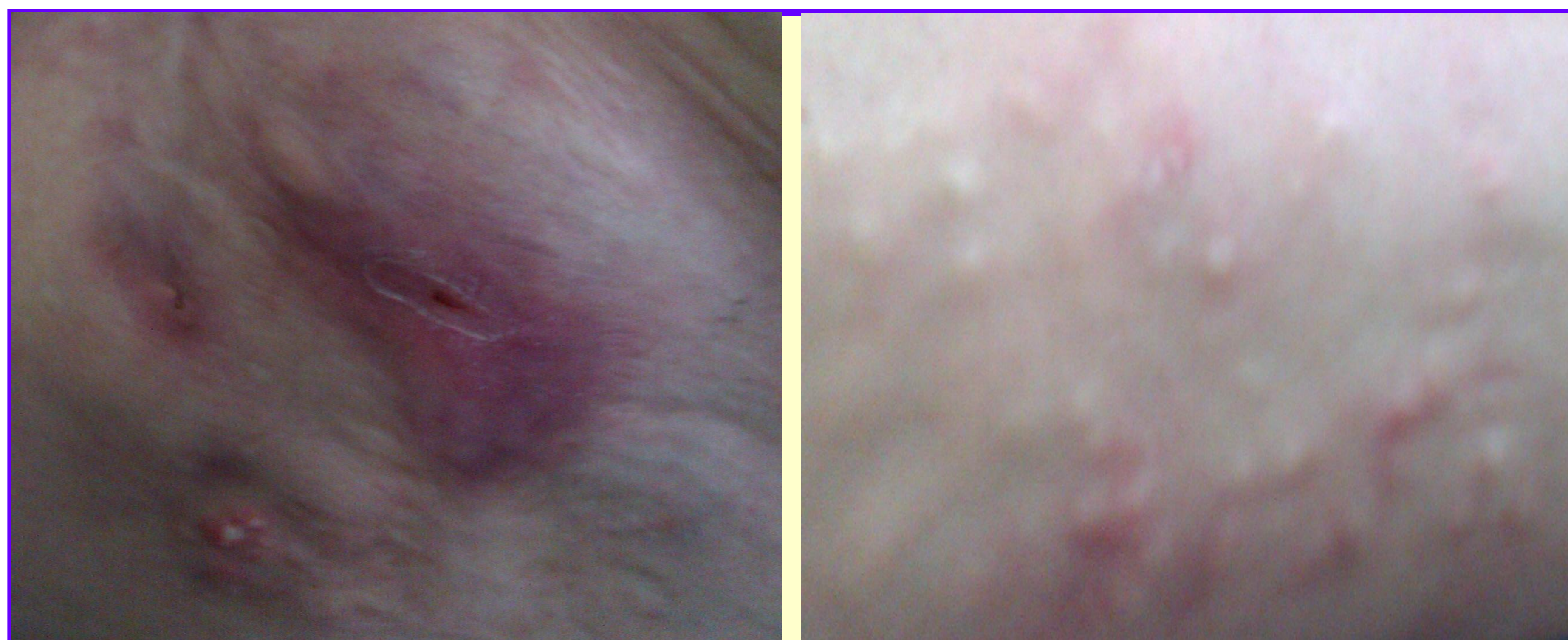
Picture 1: Calcinosis over a right hip and proximal part of the right arm

During the last 12 years, systemic corticosteroids and other different immunosuppressive and immunomodulatory agents (methotrexate, cyclophosphamide, azathioprin, mycophenolat, colchicine), intravenous bisphosphonates, immunoglobulins and calcium antagonists were given in attempt to establish a better disease control, stop spreading and reduce a calcinosis along with tissue damage but without any significant improvement.