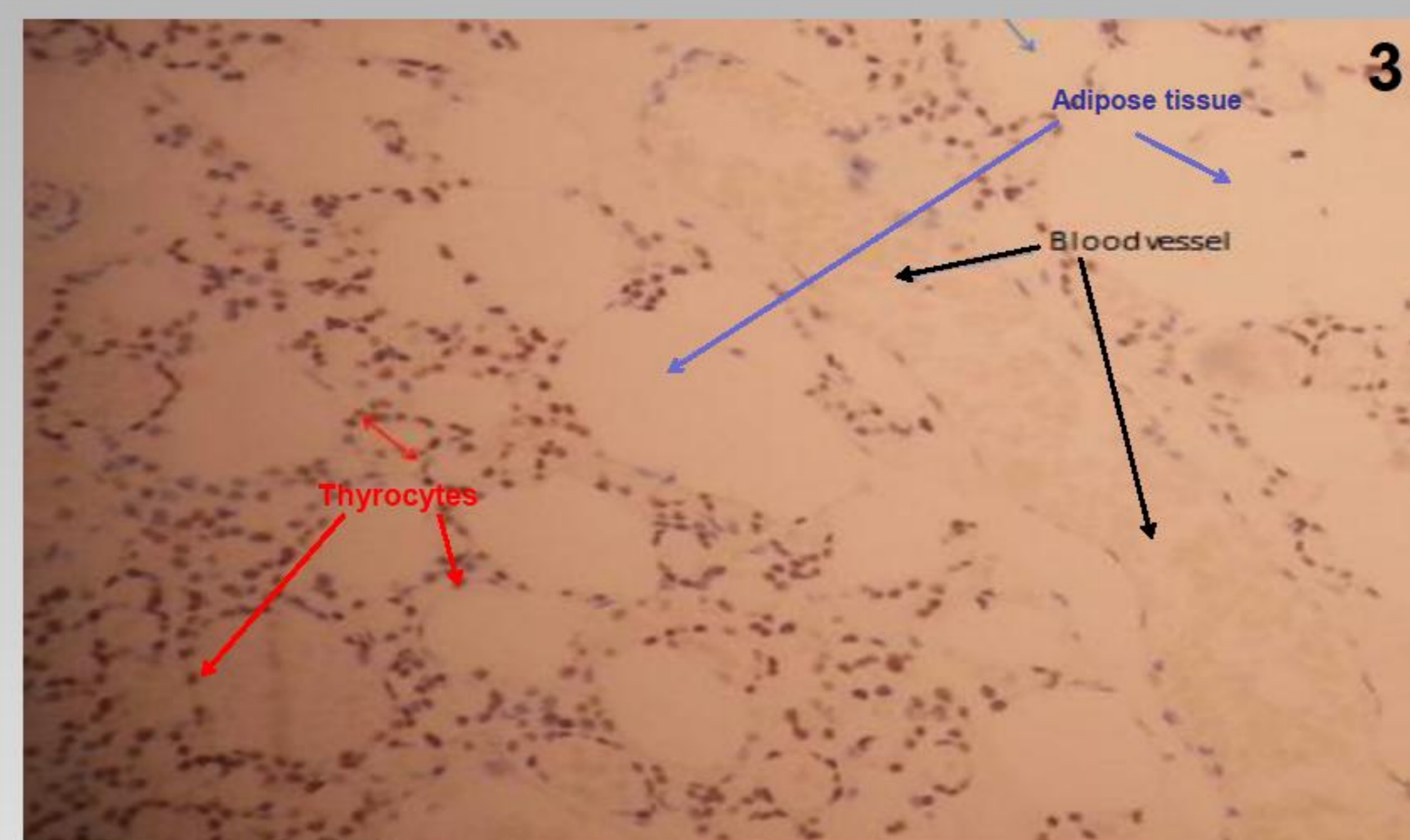
Figure 1: Mature adipose tissue groups between the thyroid follicular structures in a colloidal nodule (4x10 Haematoxylin-Eosin Staining)

A 56 year-old man was admitted to our out-patient clinics with the complaint of a lump in his left cervical region. His thyroid function tests were normal. Thyroid autoantibodies were negative. In physical examination, a mobile soft nodule of about 4 cm in the left lobe was realized. In thyroid ultrasonography, multiple nodules with a maximum dimension of 45x30 mm were reported. No pathological lymph nodes were detected. In fine needle aspiration biopsy of the biggest nodule, benign thyrocytes with the presumption of cystic colloidal nodule were reported. Because of the hugeness of the nodule and multiple nodular nature, total thyroidectomy was performed. In thyroidectomy pathology, bilateral multinodular hyperplasia was reported. In right lobe of the thyroid gland, in a 9x6 mm subcapsularly located clearly defined marginated nodule, which is reported as a thyrolipoma, mature adipocytes between the colloidal material and thyroid follicles were detected. At the staining of this nodule immunohistochemically with TTF-1 (Thyroid Transcription Factor-1), there was positive staining with TTF-1 in the nuclei of the thyrocytes surrounding the follicles ruling out any intrathyroidal parathyroid gland. No adipose tissue infiltration other than this lesion was detected at the microscopic assessment of the remaining thyroid gland. The patient recovered well after surgery and levothyroxine replacement therapy was initiated.