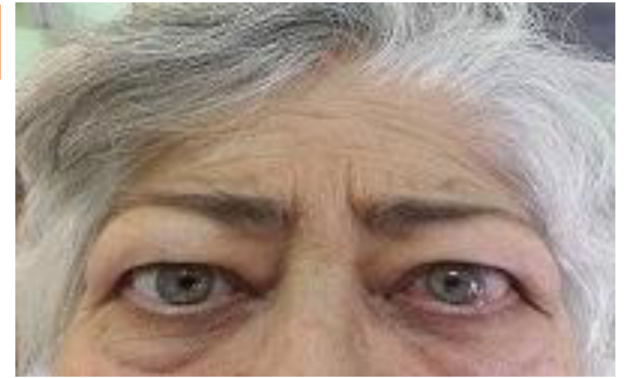
Figure 1- clinical presentation at admission

Thyroid disorders are common within the elderly population and are particularly challenging to diagnose and treat due to the presence of a wide variety of comorbidities. Graves' ophthalmopathy remains a therapeutic predicament despite all progress made in understanding its pathogenesis, especially in the elderly population with severe presentation.