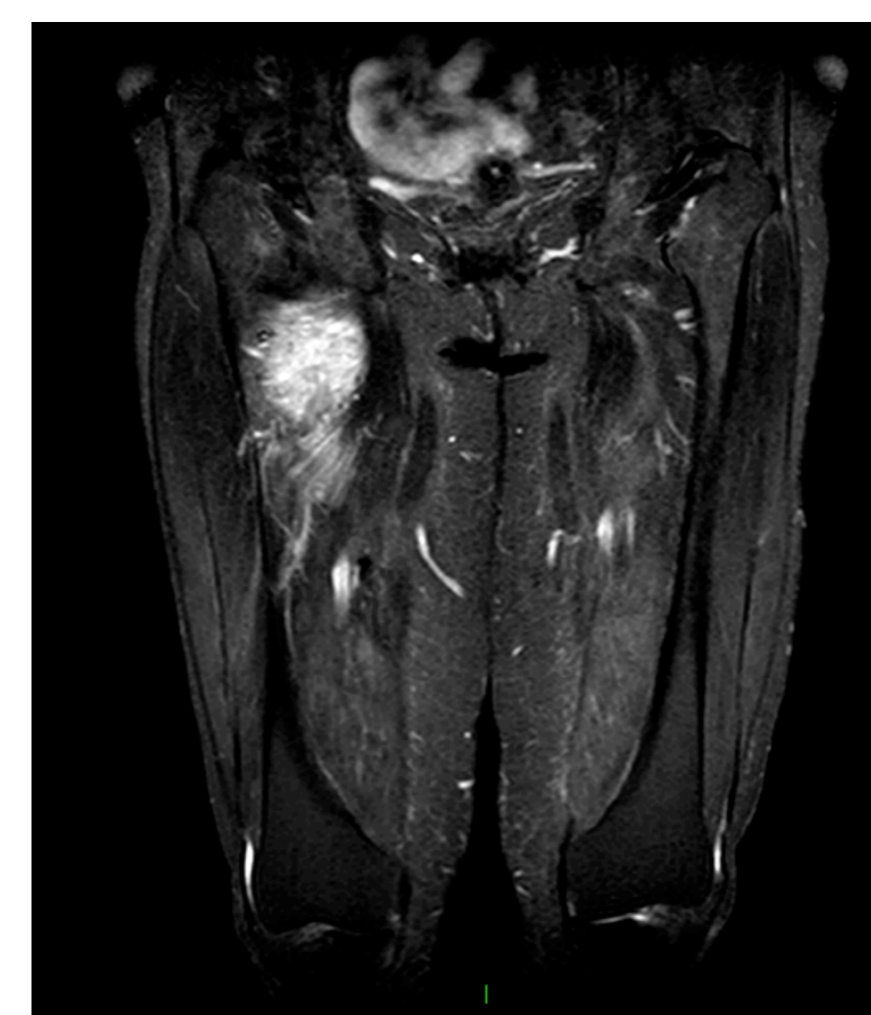
Figure 2. MRI of the right thigh.

A MRI of the right thigh was then undertaken. This demonstrated a well-defined infiltrative enhancing lesion in the right proximal thigh within the adductor musculature (figure 2). This patient has been referred for consideration of surgical resection.