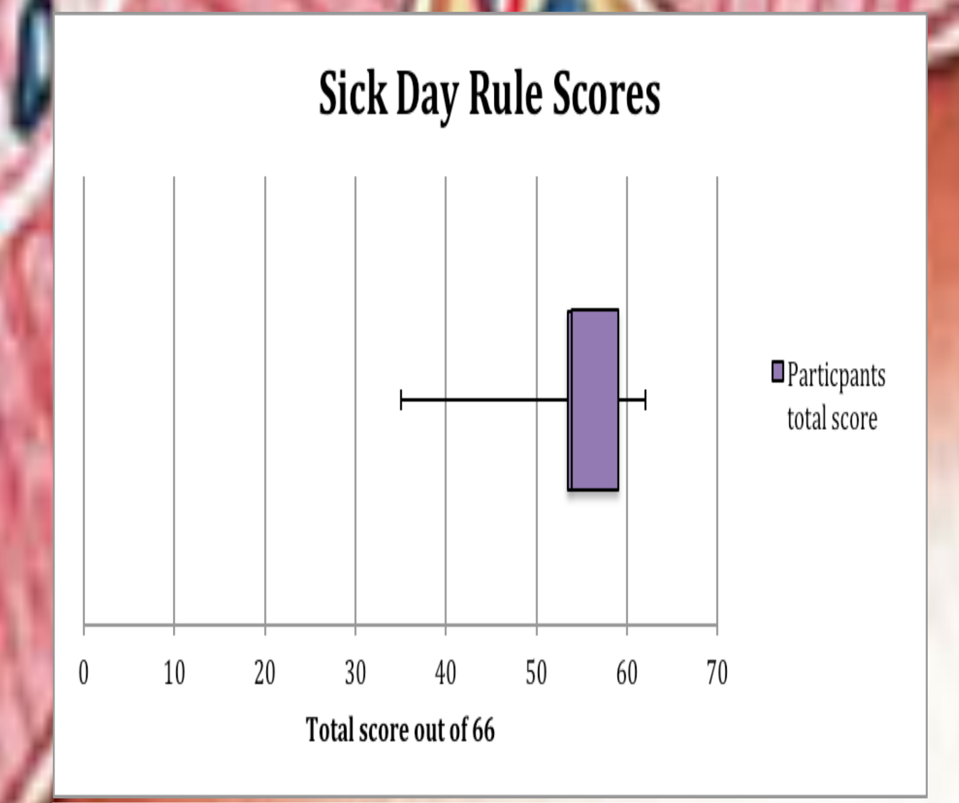
Figure 2: shows the 7 participants total score for the 11 questions asked relating to sick day rules in the study. It shows that the minimum score was 35 and maximum of 62. The median score was 53.9 out of a total of 66, with an interquartile range of 5.5.