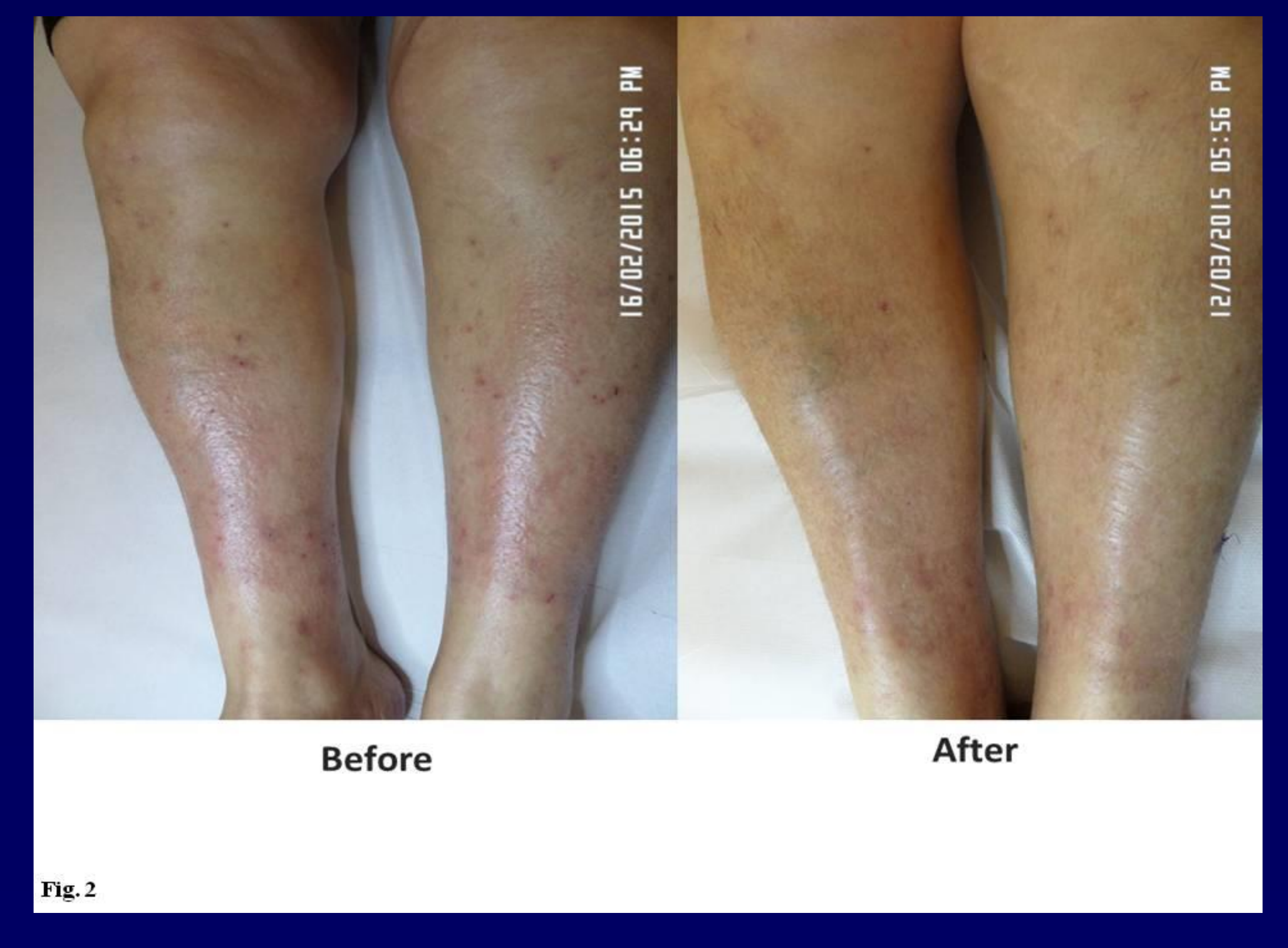
Fig. 2 Skin lesions before and after successful corticosteroid application

Conclusions: This is a rare case of PM in a euthyroid patient, with no evidence of thyroid autoimmunity. Six other euthyroid PM cases have been reported (one with positive TSI, two with negative TSI and not measured in the other cases).