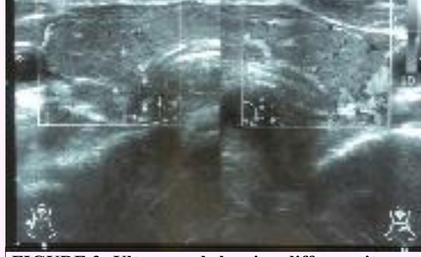
FIGURE 2- Ultrasound showing diffuse goiter with increased vascularity