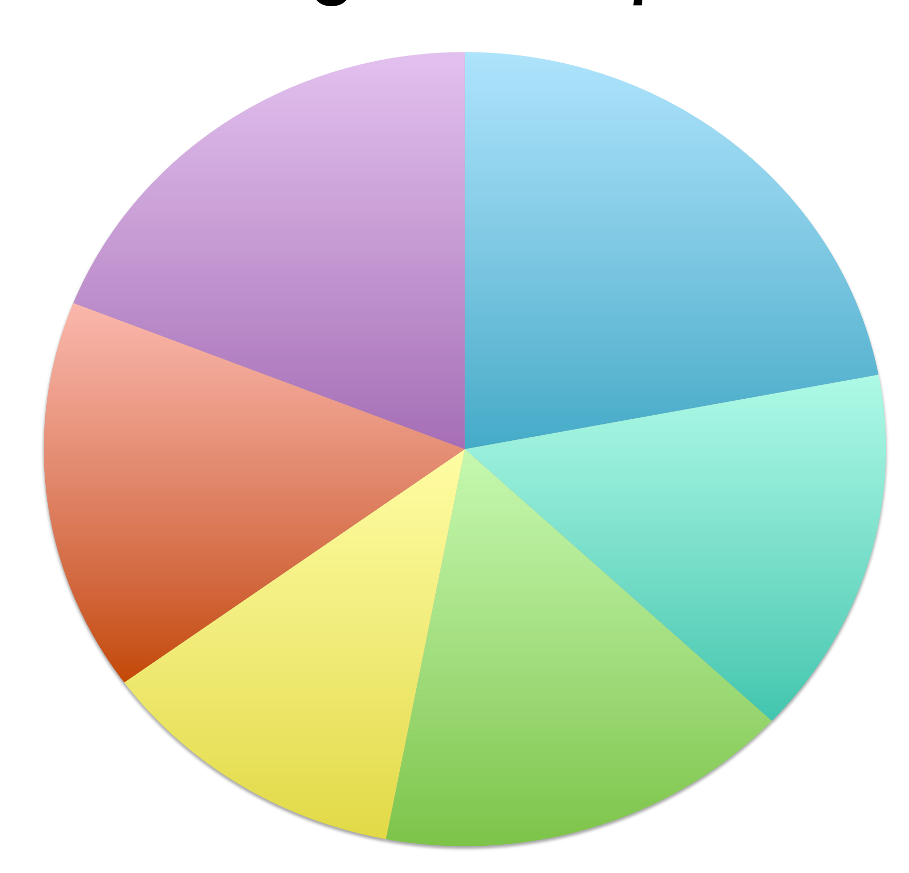
Figure 1: Clinical setting of initial presentation

Results: 103 women were identified, who were Figure 2: Proportion of women who had the necessary settings (Figure 1). Only 9 women were seen in more of presentation than one clinical setting. The median age was 31.7 years (IQR 21.0-37.4 years). Overall, the results were well below the target for each standard (Table 1). With regards to the investigations performed, there was significant variation in the performance of a karyotype and TPO Abs between the different clinical settings (Figure 2). With regards to treatment options discussed, there was significant variation between the different clinical settings for all apart from contraception (Figure 3).