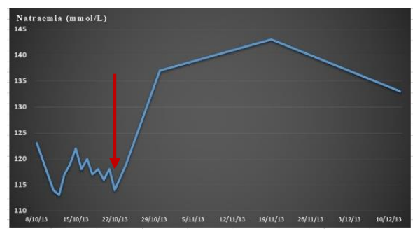
Fig. 2: Effect of the introduction of demeclocyclin (arrow) on patient's natraemia: quick and persistant correction of hyponatraemia .

A treatment with demeclocylin 600 mg daily was initiated, with a response within 6 days as natraemia increased to 137 mmol/l, with persistant efficacy at 2 months and with good tolerance (fig. 2).