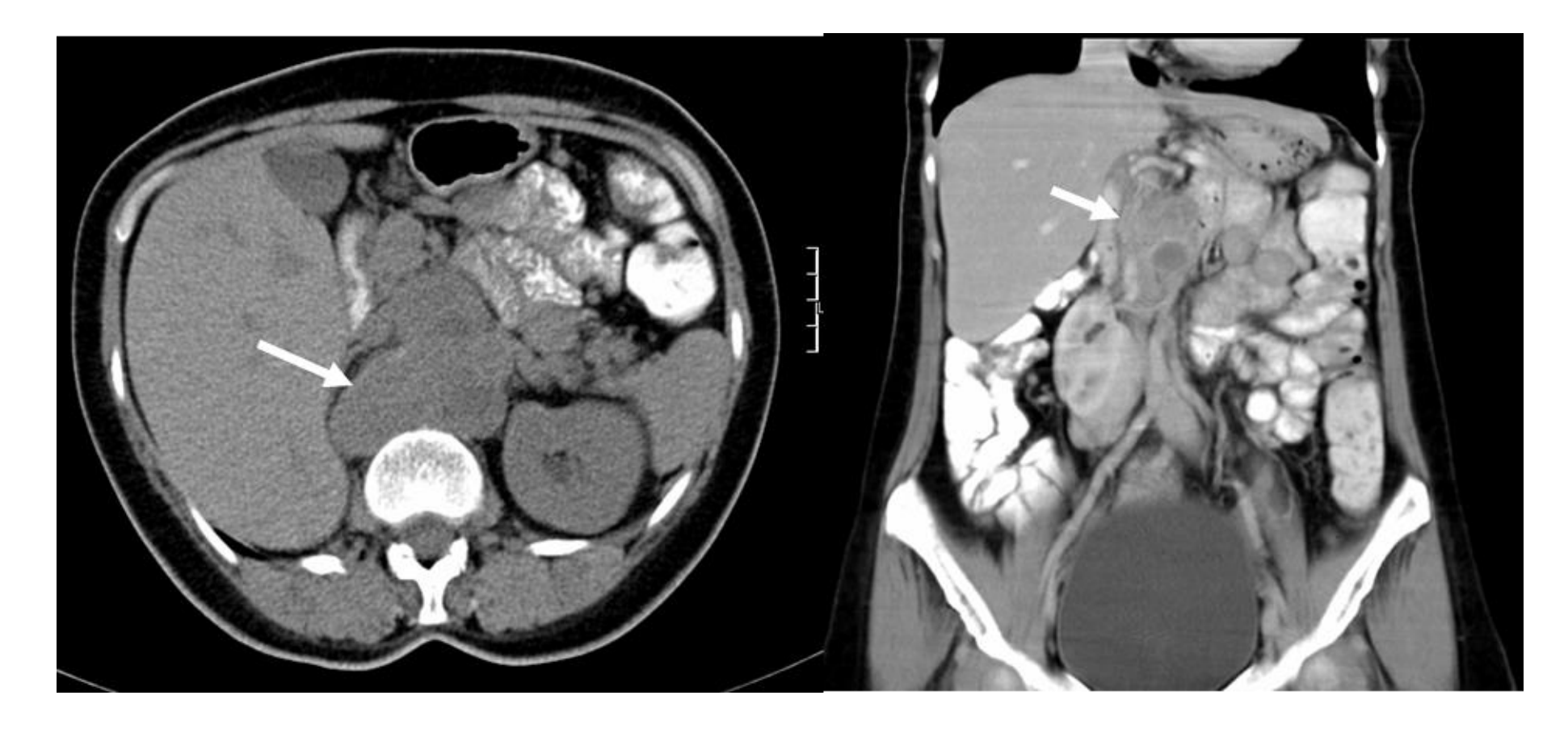
Figure 2: The arrows show retroperitoneal aortacaval mass in abdominal CT (transverse and coronal images)

Figure 1: High FDG uptake of mass in PET/CT