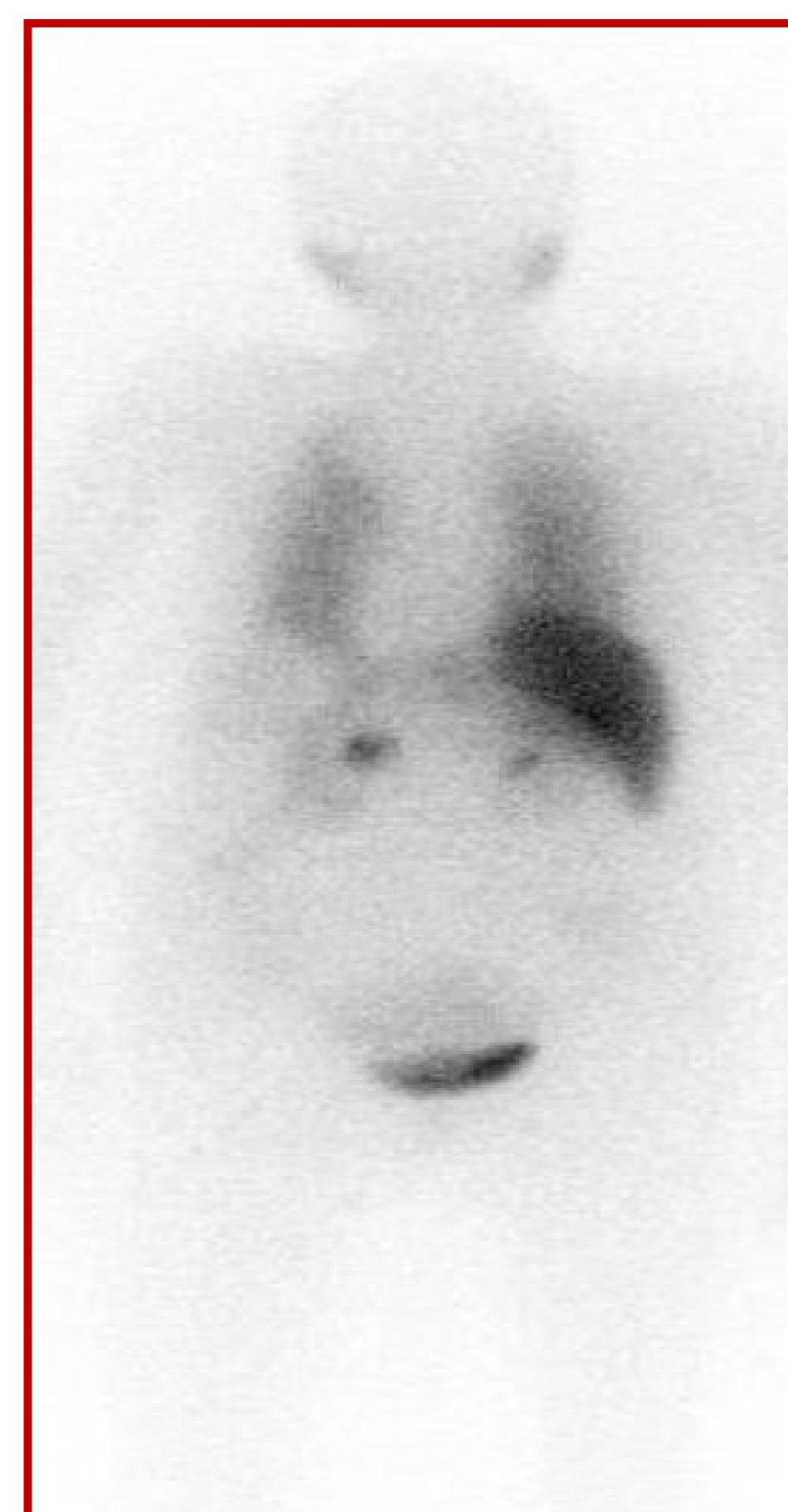
Figure 1: MIBG scan showing diffuse uptake in the lesion near to the left adrenal gland (posterior view)