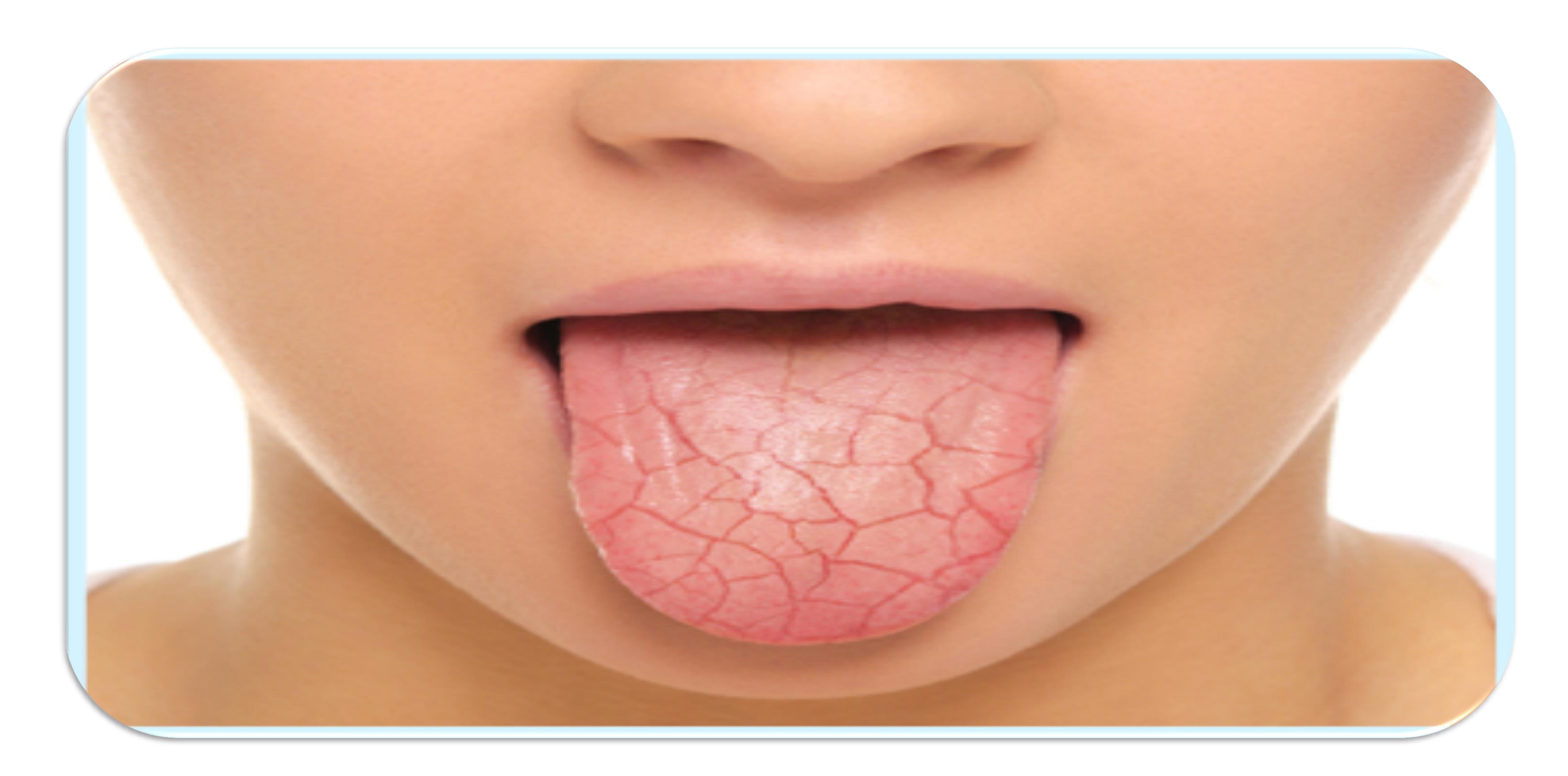
Fig 2. Rough, dry tongue observed in xerostomia

Owing to reduced salivary flow rate as a result of snoring and mouth breathing during sleep, nocturnal oral dryness is a normal entity, yet day-time oral dryness is a finding associated with systemic diseases such as Sjögrens disease, diabetes, vitamins A and E deficiencies for which she was negative or pharmaceutical drug use, one of which are statins. She was temporarily changed from simvastatin to atorvastatin due to persistently high LDL cholesterol and the high risk of both CVD and PVD associated with high lipoprotein a. Atorvastatin was also stopped for 4 weeks and it substantially did help to minimize her xerostomia.