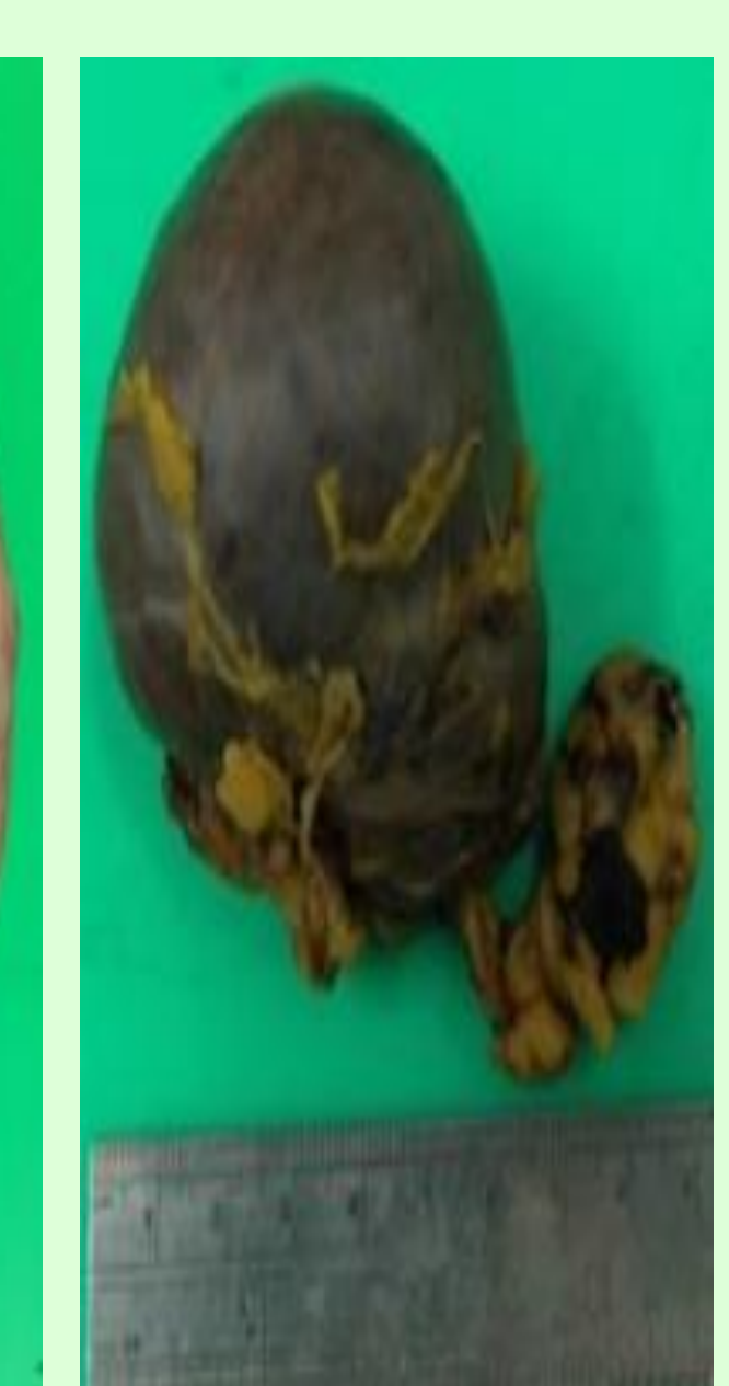
Right -2.9kg Left -2.1 kg Left Adrenunculus-27 x 21 cms 25 x 15 cms 85 gms